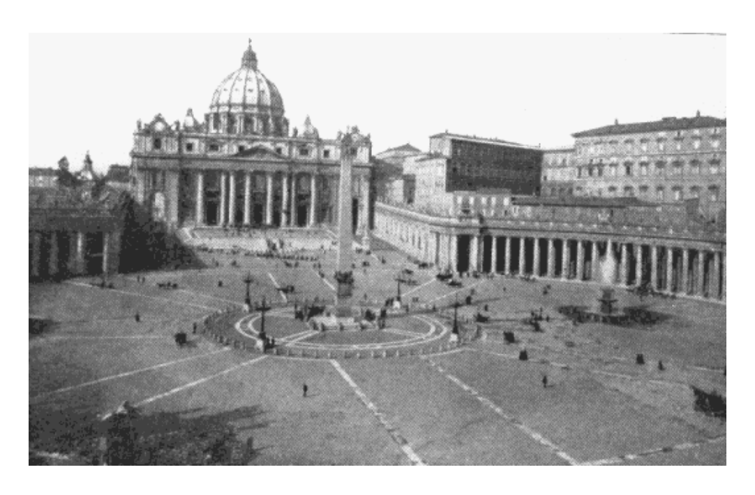
The obelisk, as it was shown standing before St. Peter's Church in Rome, in the 1911 Encyclopaedia Britannica